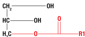
Figure 1. Monoglyceride Chemical Representation in MaxSimil Fish Oils (R1 = fatty acid)

Unique structure: One fatty acid attached to a glycerol backbone provides two polar ends that attract water and a non-polar tail end (R1) that attracts fat, thus enabling self-emulsification of the Omega MonoPure formulas.